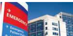
HOSPITALS & HEALTHCARE

The DORMA 01 series is available as a chain or heavy duty belt drive and can be interfaced to an extensive range of door control and program switches, push buttons, presence/safety sensors, P-E safety beams and a wide choice of signage plates including Braille.