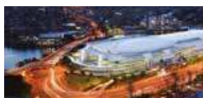
HOTELS & CONVENTION CENTRES