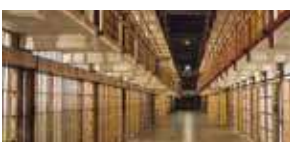
LAW ENFORCEMENT BUILDINGS